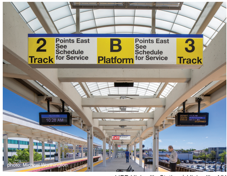
LIRR Hicksville Station | Hicksville, NY