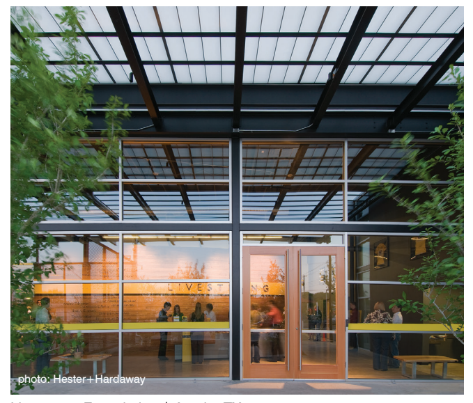
Livestrong Foundation | Austin, TX