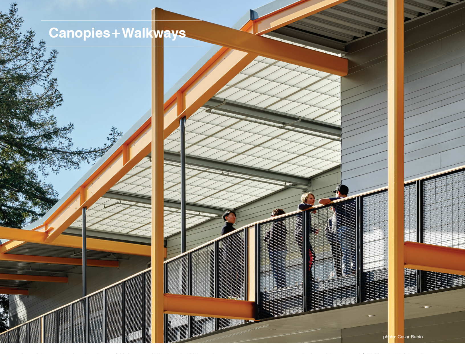
Joseph Steger Student Life Center | University of Cincinnati, OH (cover) Moore Ruble Yudell Architects & Planners