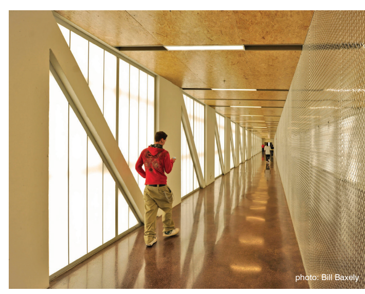
Dollar General Distribution Center | Bessemer, AL